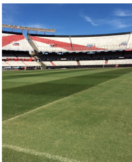
Argentina bermudagrass overseeded with Med Gold