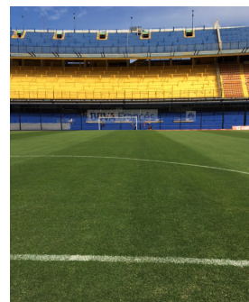
Med Gold in Argentina Stadium